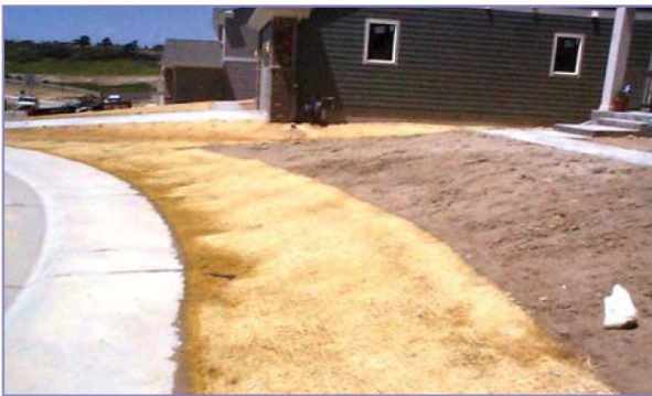
This rolled erosion control product (RECP) is used to prevent erosion and keep the streets clean while homes are being built. A sediment barrier is needed until vegetative cover is established.